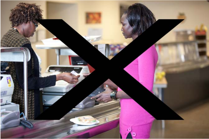
She will not buy her lunch three times a week.