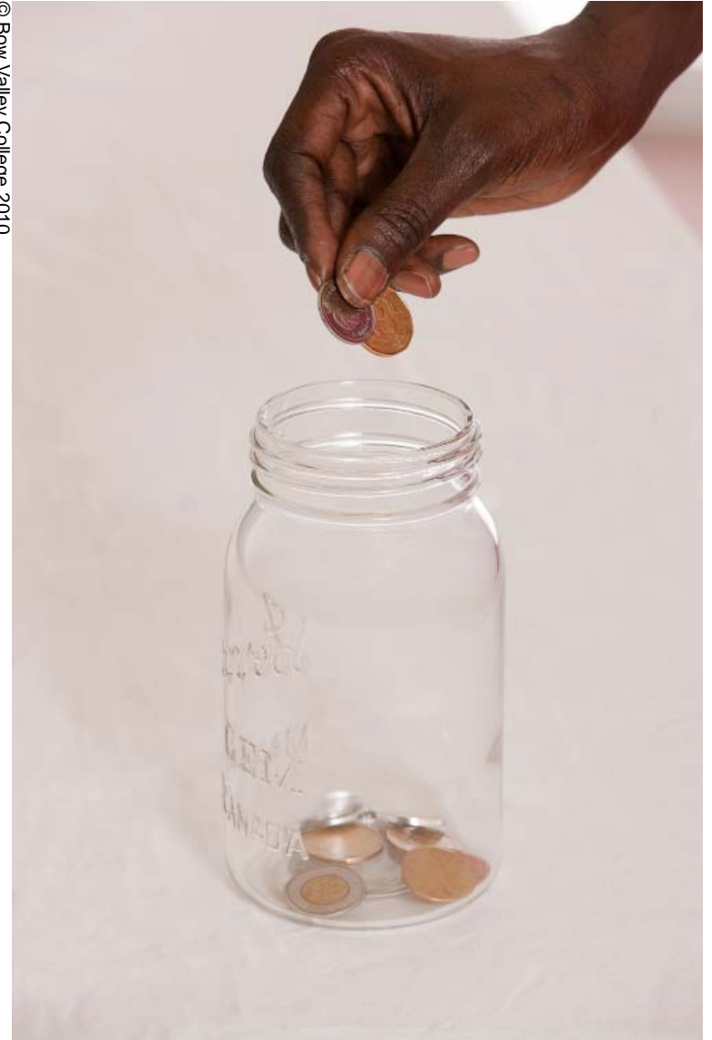
She needs to save more money.