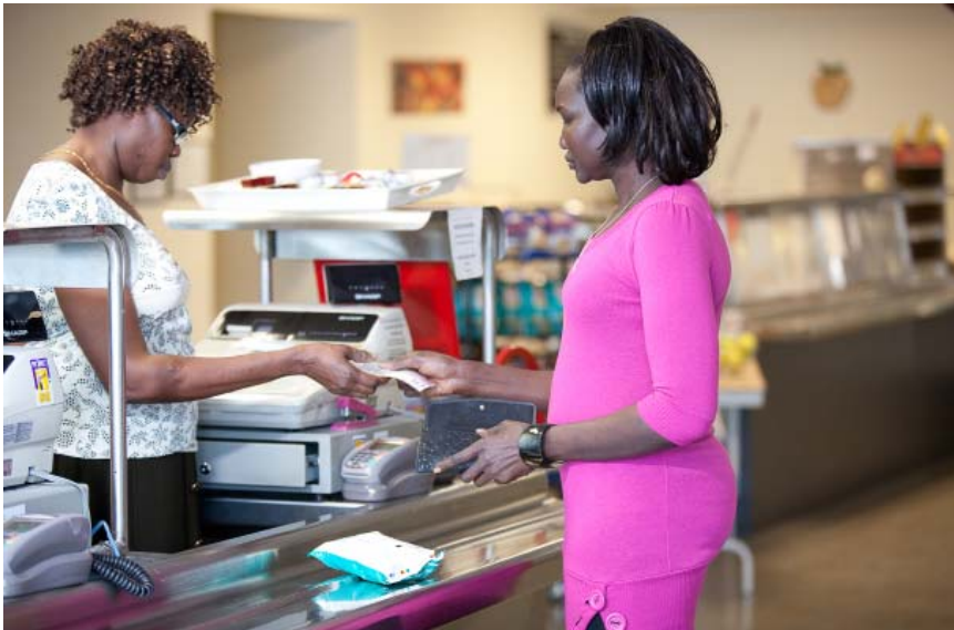
She buys a bag of chips every day.