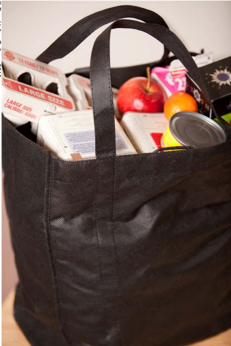
She needs to buy groceries every month.