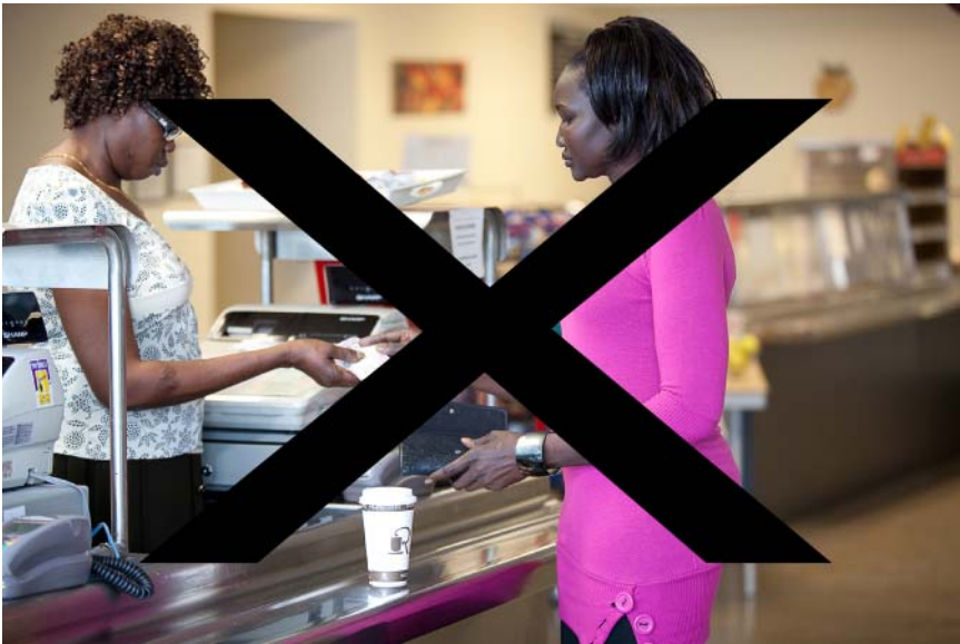
Sarah will not buy a cup of coffee every day.