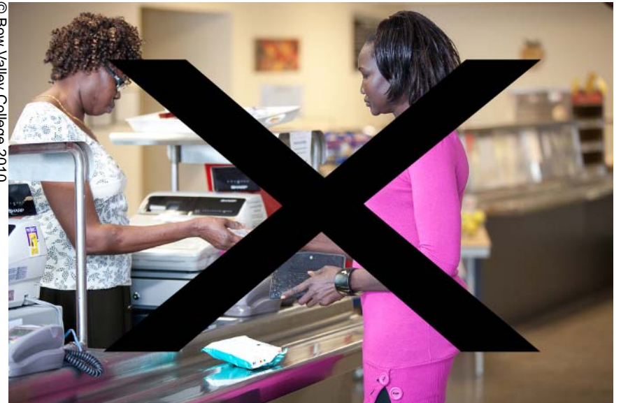
She will not buy a bag of chips every day.