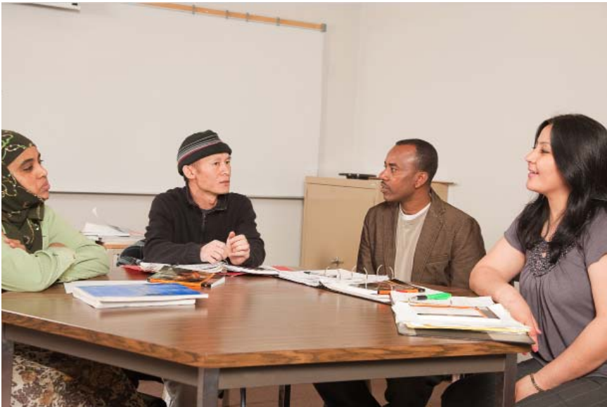
The students listen.