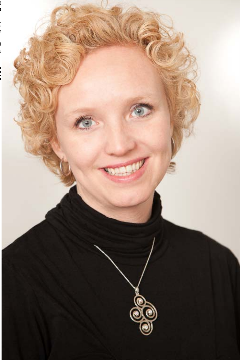
She likes her teacher.