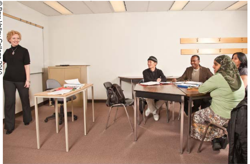
The teacher says "Good morning".