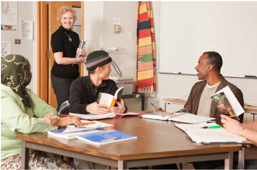
The teacher comes to class.