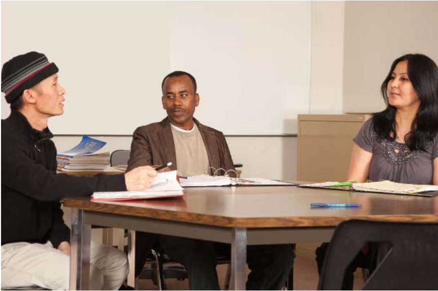
She sees her classmates.