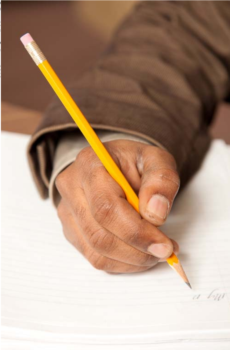
The students take out pencils.