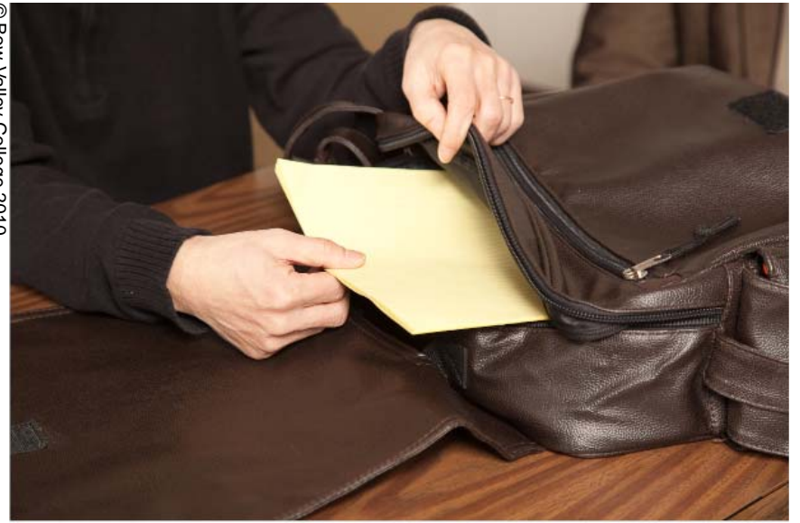
The students take out paper.