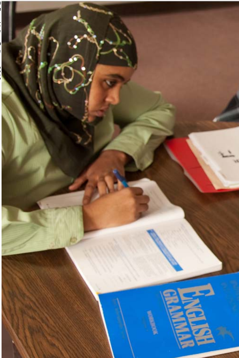
She studies English.