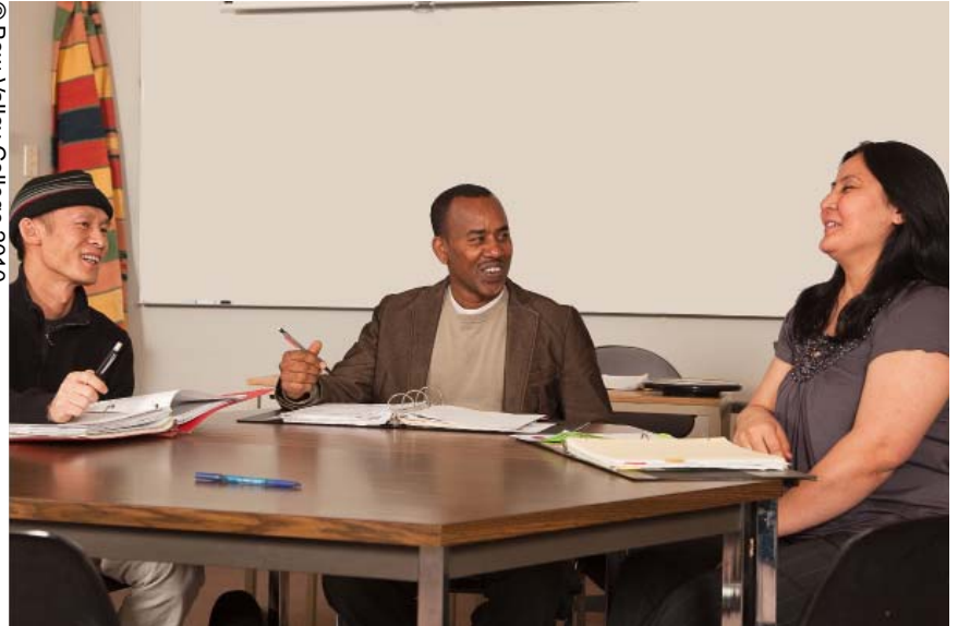
She likes her classmates.