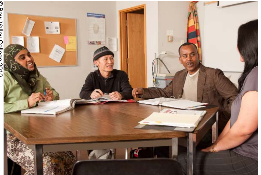
The students talk.