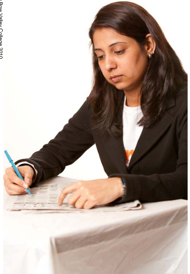
She looks at job ads.