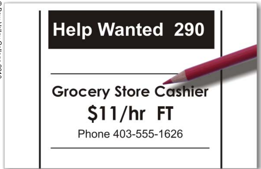
It is for a cashier.