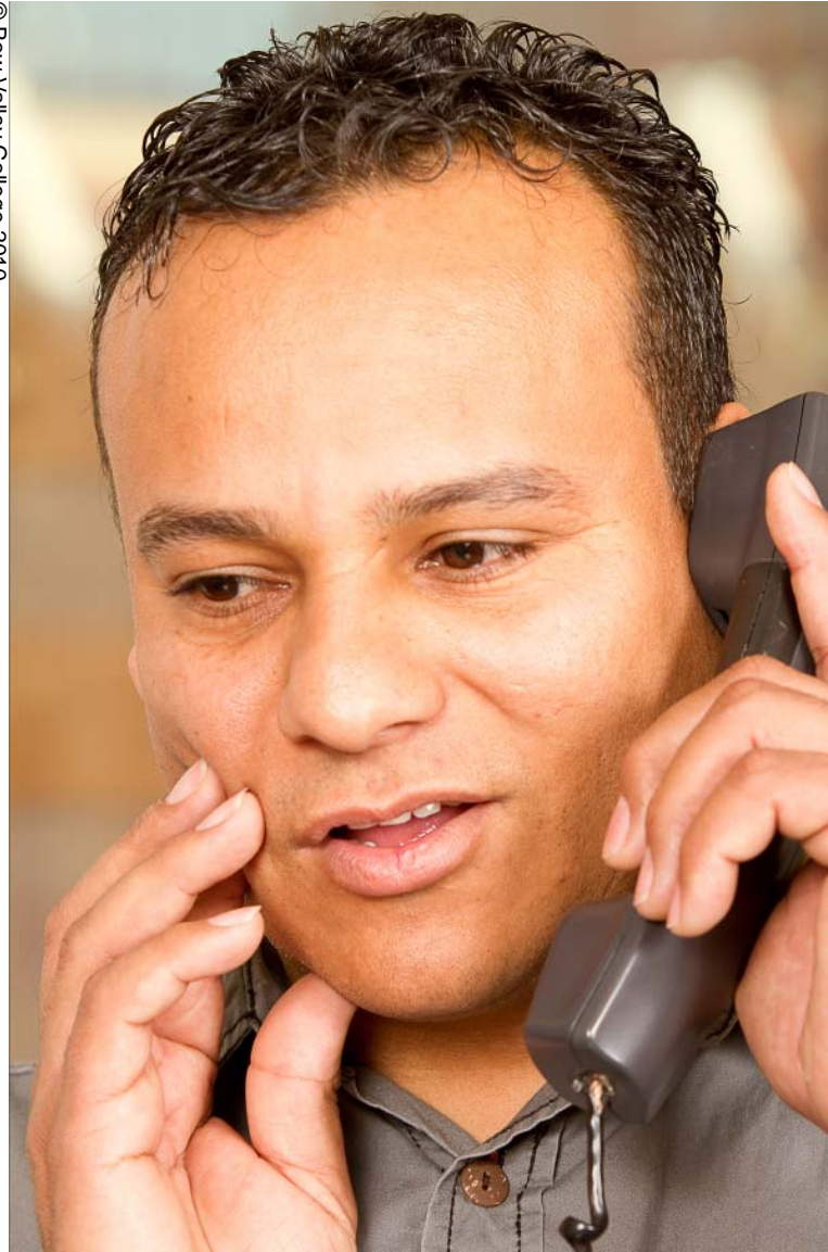
He calls the dentist's office.