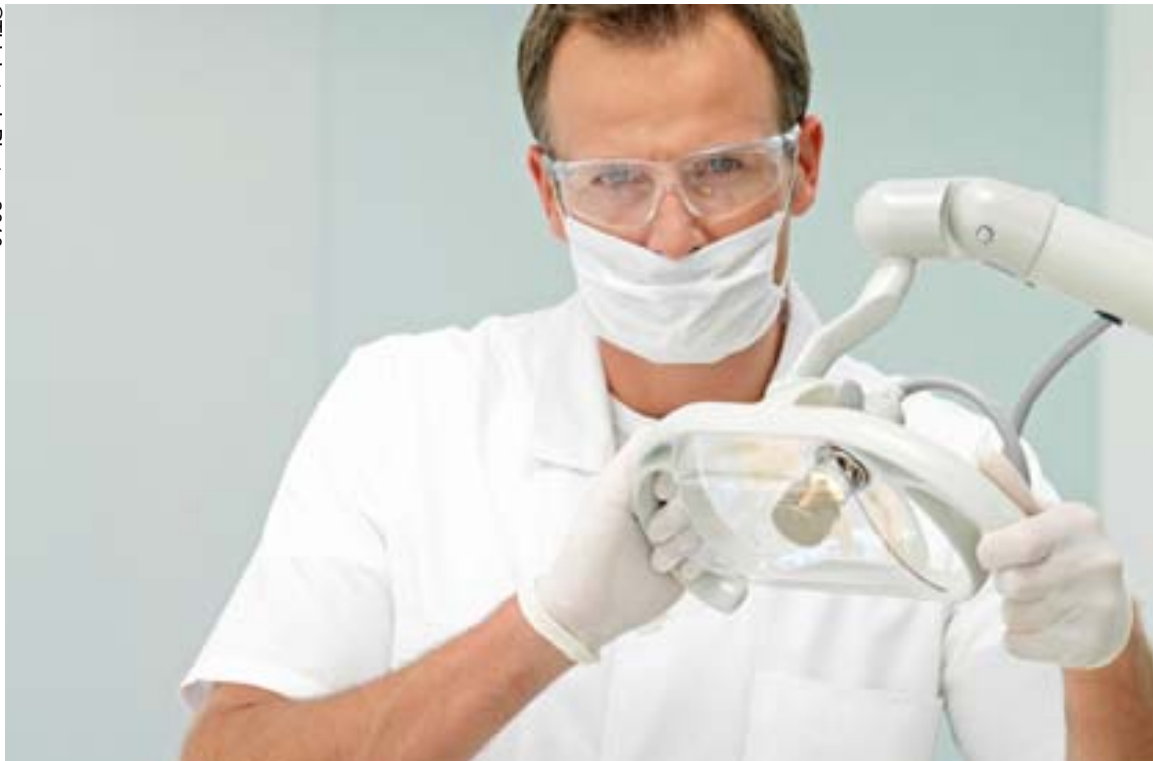
He sees the dentist.