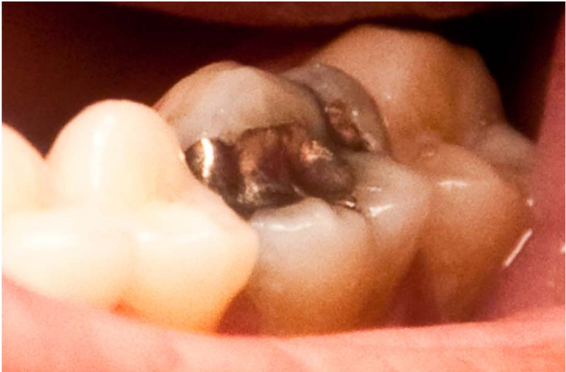
He gets a filling.