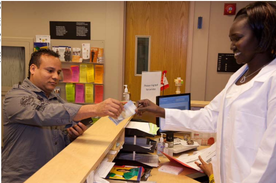
He can pay some money today.