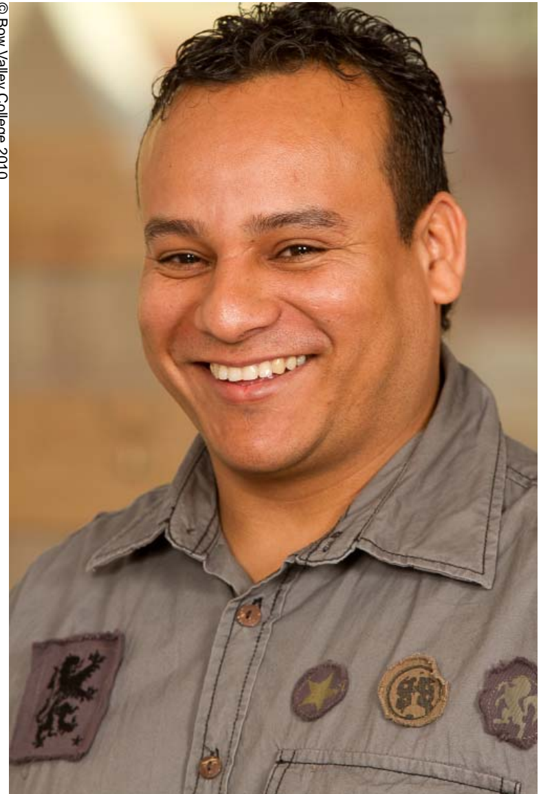
It is okay.