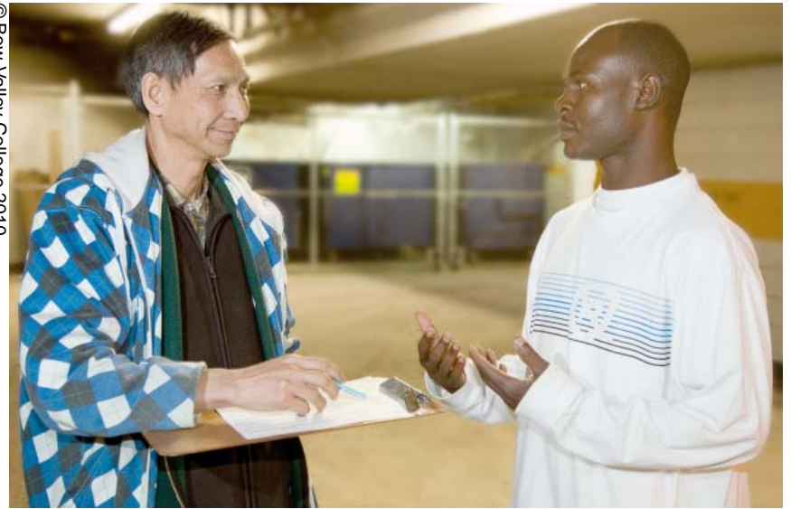
He talks about his back.